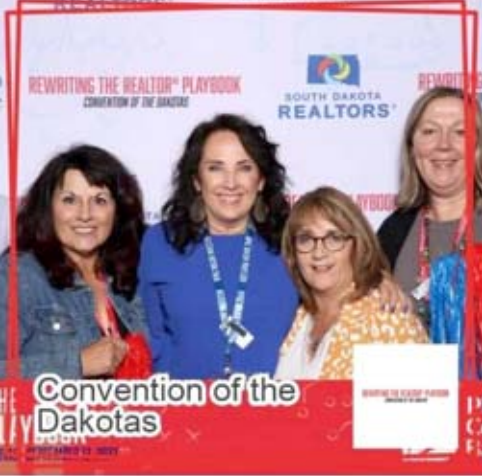
Rewriting the REALTOR® Playbook | Convention of the Dakotas