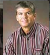
Neal Messer Federal Taxation