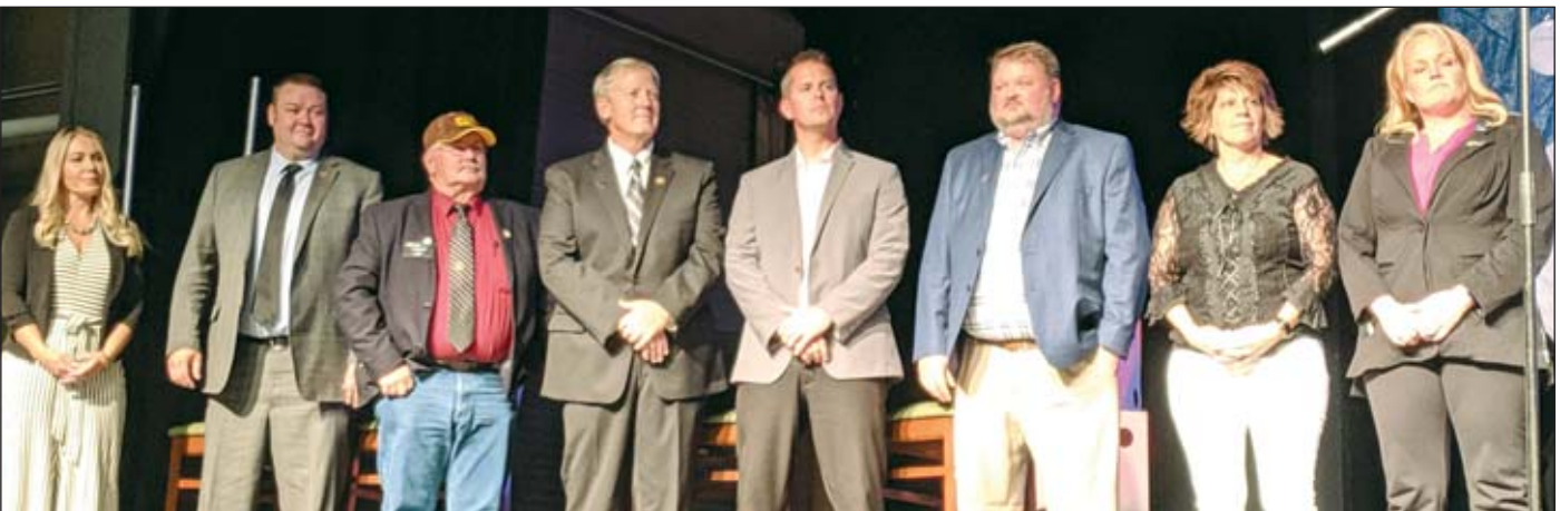
2020 SD/ND Officer Installation.