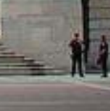
TBD Professional Standards