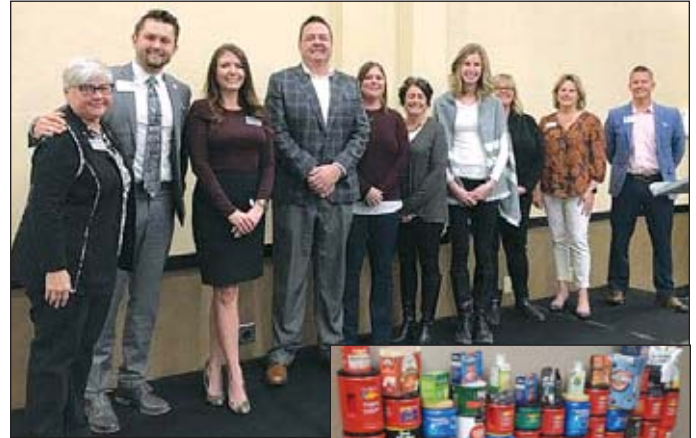
Congratulations to our recently installed Officers and Directors: