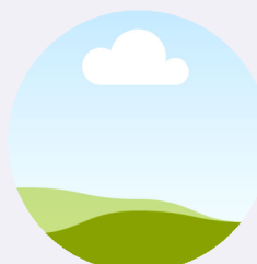
RPAC Trustees Chair, TBD