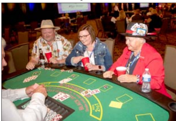
Attendees Make it Great