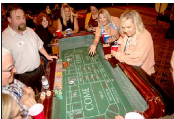
Casino Night was a Blast!