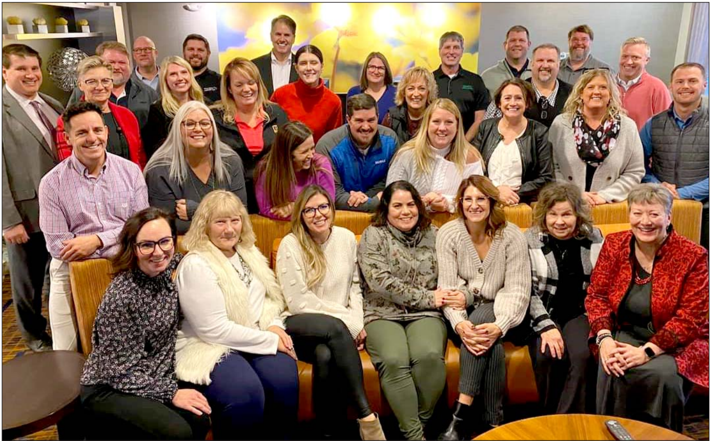
The 2023 NDAR Board of Directors met December 7th & 8th in Bismarck. The two day session was hard work for all (and some festivities), as the goals were set for 2023 according to the NDAR strategic plan.