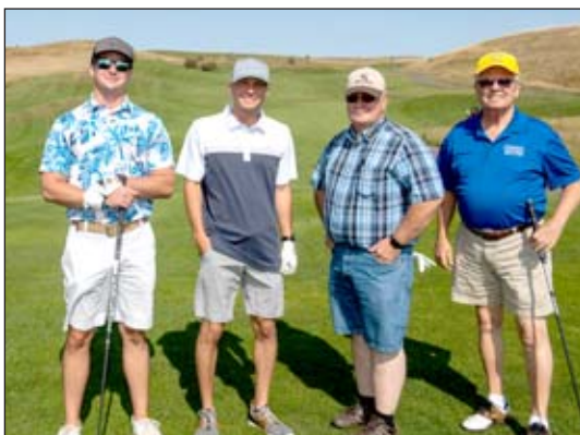
Golf at Hawktree